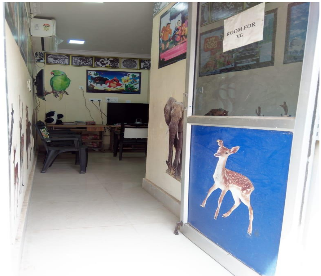
Herein below is the layout of a Child Friendly Court room: